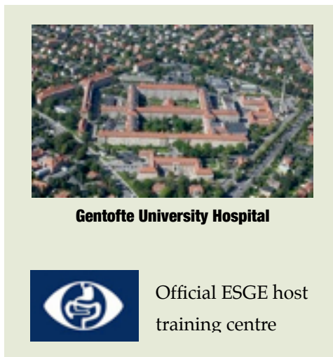
Gentofte University Hospital

Transesophageal (EUS) and endobronchial (EBUS) guided fine needle aspirations (FNA) have been proven to be safe and accurate methods for the diagnosis of tumours in the lungs and the mediastinum, including the diagnosis and staging of lung cancer, where the combination of EUS and EBUS can serve as a complete "medical" mediastinoscopy. Unfortunately, the access to the accessibility to these methods is not yet widespread. Implementation and training is still a challenge for the chest physician.